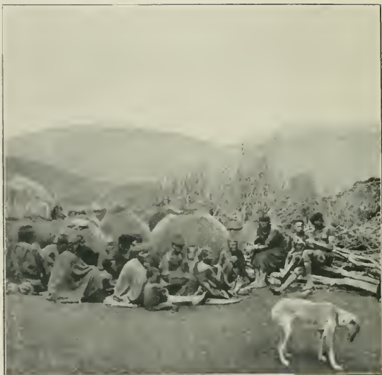
A NATIVE VILLAGE